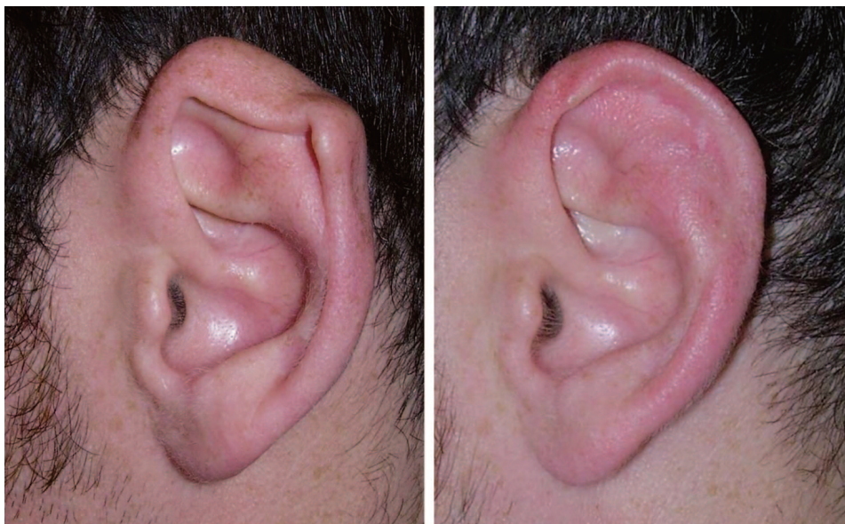
Fig. 1. ( Left ) Left unilateral deformational auricular anomaly. ( Right ) Follow-up at 18 months.

Nagata described a case of a minor-degree constricted ear similar to ours, treated with expansion of the helical circumference by multiple incisions completed with helical rim graft remodeling. 4 Sugino et al. presented correction of a different type of ear deformity, Stahl's ear, using the cartilage turnover and rotation method. 5 The principle of using pathologic tissue as a source for cartilage graft is not new. Plastic surgeons are familiar with septal cartilage remodeling by means of complete removal of deviated